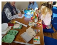
Painted Easter Eggs