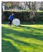
The boulder & rolling it!

Please pray for the Messy Church families. The next M C session takes place on Saturday 11 May.