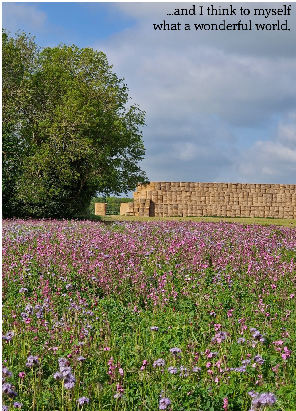
On Cockfield Airfield

...and I think to myself what a wonderful world.